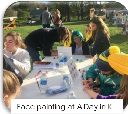
Face painting at A Day in K