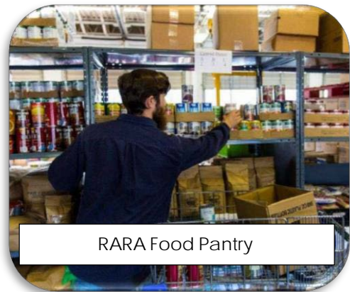
RARA Food Pantry

RARA partners with multiple local organizations and provides comprehensive support for the individuals and families they serve. They partnered with the Magnolia Center - the Community Services Board Adult Day Support Center - to provide meaningful volunteer opportunities. RARA also hired an AmeriCorps VISTA member to focus on nutrition education and volunteer