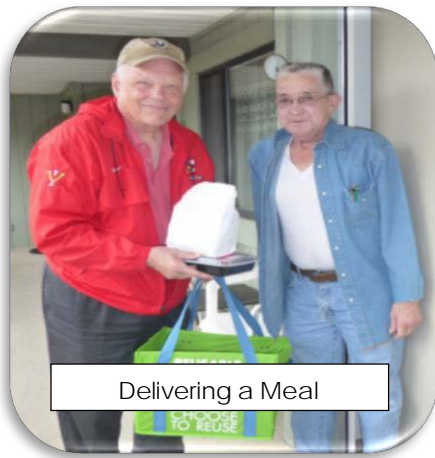
Delivering a Meal

Meals for Shut-Ins delivered meals to thirty to thirty-five clients in Lexington every weekday. They also collaborate with Meals-on-Wheels on emergency weather non-perishable food boxes.