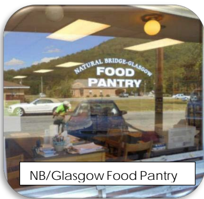
NB/Glasgow Food Pantry

The NB/G Food Pantry delivered food boxes to up to 400 households each month. The Food Pantry is totally run by volunteers.